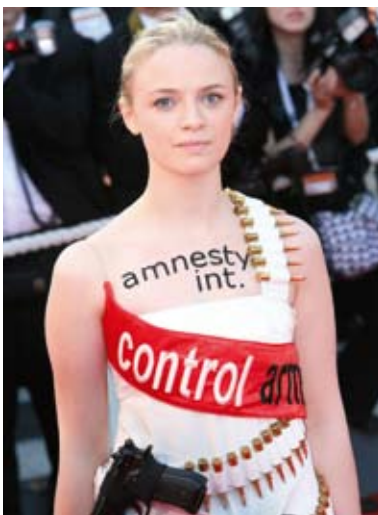
Left: Sarah Forestier at the Cannes Festival.

"World arms control means much less chance of human suffering, exploitation and injustice – and greater hope for world development, fairness and human rights."