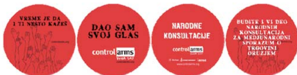
Below: Serbian stickers