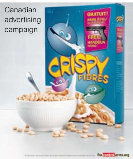
Canadian advertising campaign