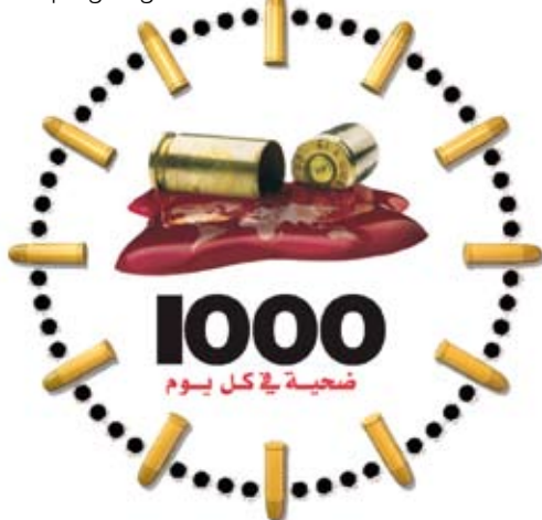
Campaigning material from Bahrain

Participants worked in small groups to discuss arms trade issues and then signed a letter that was later delivered to the Ministry of Foreign Affairs.