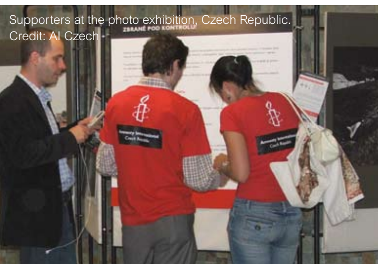
Supporters at the photo exhibition, Czech Republic.

At the national Consultation in Skopje, young people handed in their toy guns, which were turned into a sculpture. Journalists for Children and Women’s Rights and Protection of the Environment in Macedonia (JCWE) spearheaded the People’s Consultations in Macedonia, organising a one-day training session on the ATT, attended by 63 journalists. Consultations also included public meetings, a media campaign and an official meeting with the Minister of Foreign Affairs.