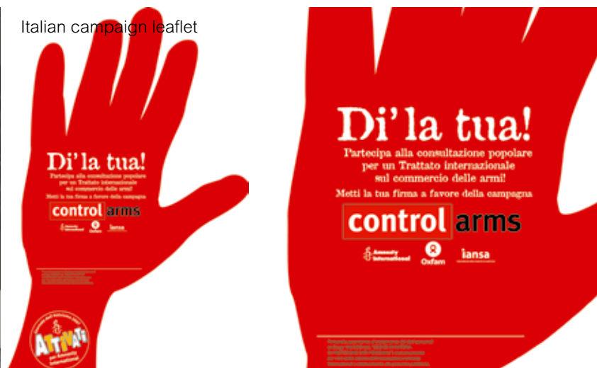
Italian campaign leaflet