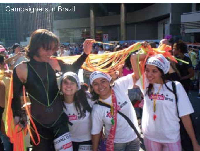
Campaigners in Brazil