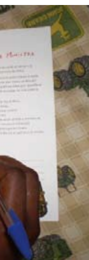
Publicity stunt in Kenya

International Physicians for the Prevention of Nuclear War (IPPNW) launched the People’s Consultations with a national radio programme that explained the basics of the Arms Trade Treaty, and what it should include and achieve. A transcript of the broadcast was then presented to government officials.